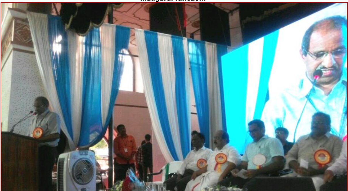
Photo: State Informatics Officer, Shri. T Mohana Dhas during the inaugural function.