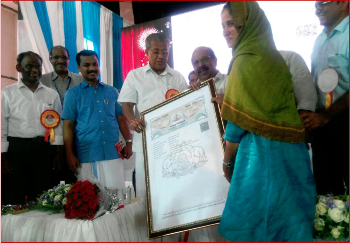
Photo: Hon'ble Chief Minister of Kerala, Shri. Pinarayi Vijayan handing over the first eStamp to Smt. Naseera Beevi, Thiruvananthapuram after the launch of eStamping for Registration.