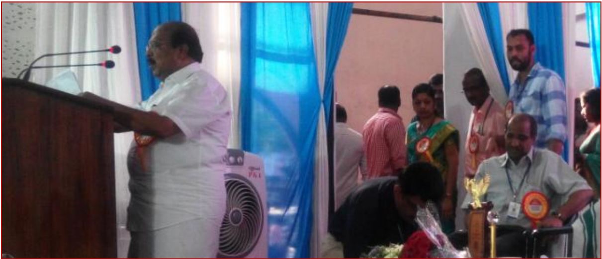
Photo: Hon'ble Minister for Public Works & Registration, Shri. G Sudhakaran during the inaugural function.