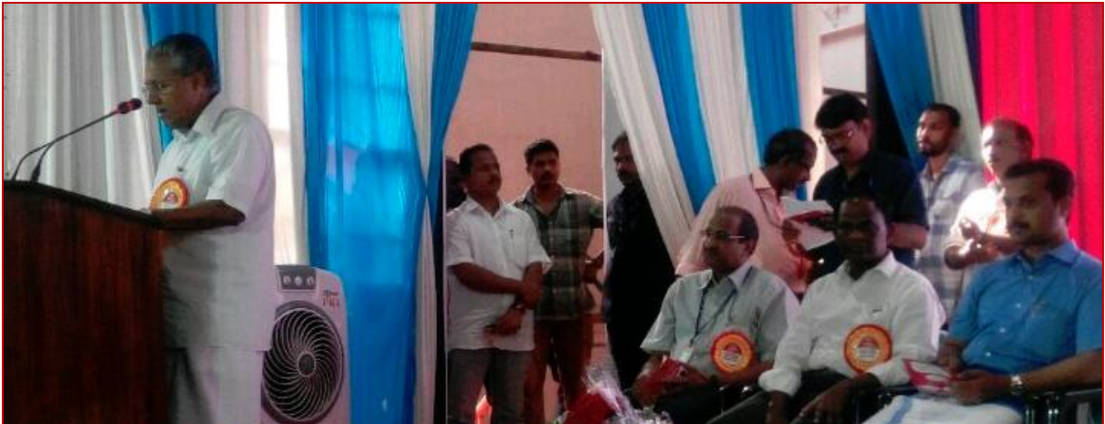
Photo: Inaugural address by Hon'ble Chief Minister of Kerala, Shri. Pinarayi Vijayan.

Government of Kerala has rolled out e-stamping for property registration having value of stamp duty above Rupees One Lakh, integrating the Registration application PEARL SUITE with Treasury application e-Treasury.