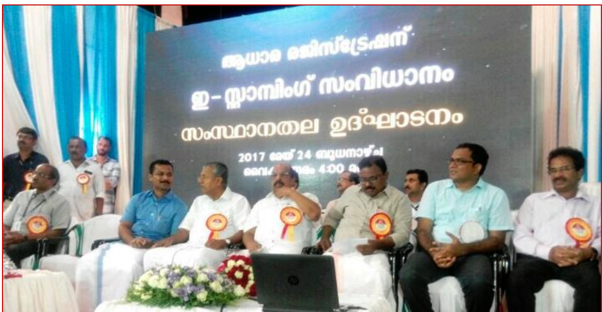
Dignitaries during the inaugural function