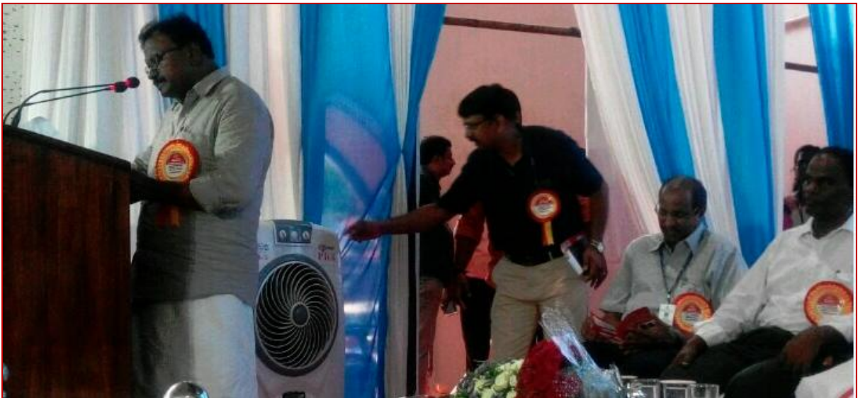
Photo: Hon'ble Member of Legislative Assembly, Shri. B Sathyan, Patron(KSDWU) during the inaugural function.