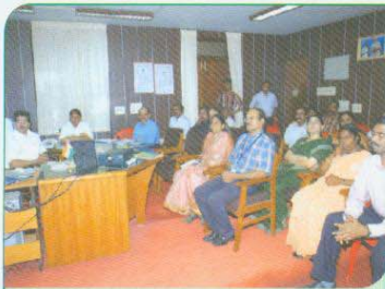
Civil Supplies Portal Inauguration by Hon'ble Minister